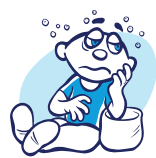
Weak or tired