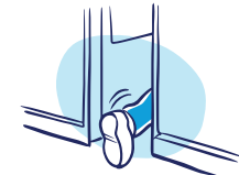
Like you have to go to the bathroom a lot