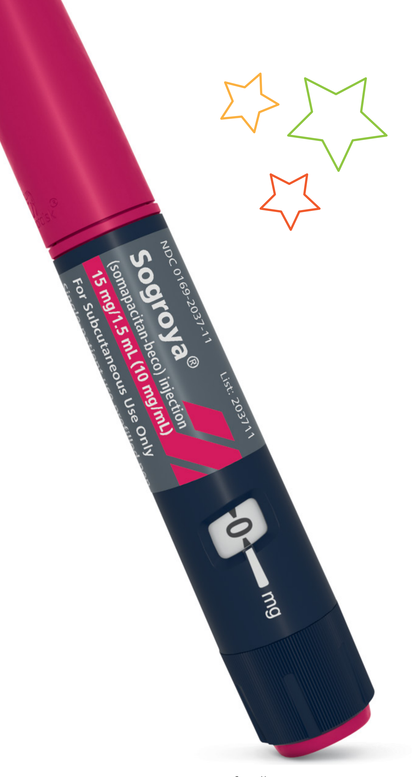
Pen is for illustrative purposes only.

<sup>a</sup>In a study, 94 people used the Norditropin<sup>®</sup> FlexPro<sup>®</sup> 30 mg pen to inject into a foam cushion and rated it a 6.7 out of 7 (on a scale of 1 to 7, where 1 means "strongly disagree" and 7 means "strongly agree"), as "easy to learn to use." The Norditropin<sup>®</sup> FlexPro<sup>®</sup> is similar to the Sogroya<sup>®</sup> pen.